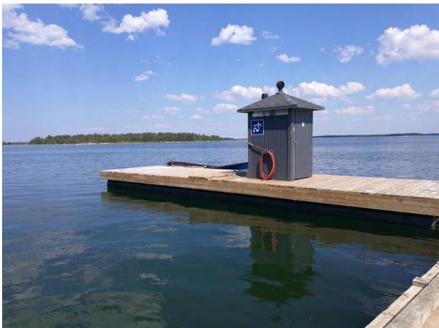
Transportable septic waste water emptying system in Kuuskajaskari island in Rauma.

Portmate.eu offers boaters practical guidance on how to sail safely and small port managers information on how to develop their port to be more safe and resource efficient. The site has three language versions and can be used in English, Swedish or Finnish.