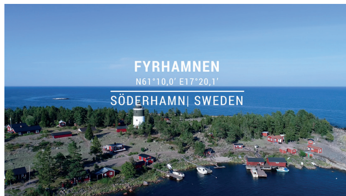
Fyrhamnen small port in Söderhamn

All the videos can be found on our website and in PortMate YouTube channel .